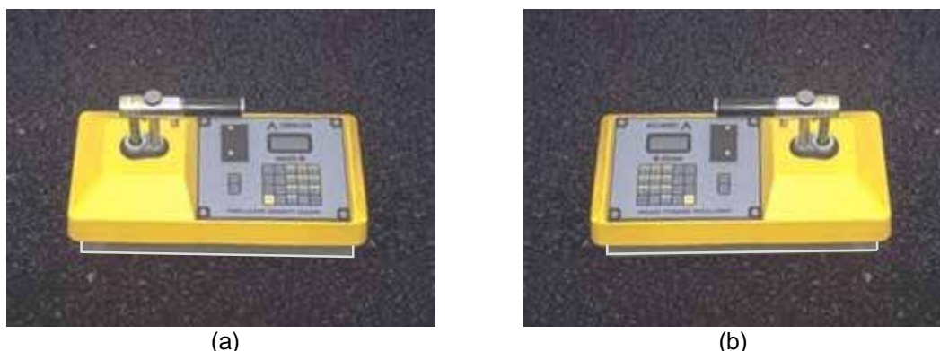
Figure 2: Nuclear Gauge Orientation for (a) 1 st One-Minute Reading and (b) 2 nd One-Minute Reading

The nuclear site is the same for QC and QV readings for the test strip, i.e., the QC and QV teams are to take nuclear density gauge readings in the same footprint. Each of the QC and QV teams are to take a minimum of two one-minute readings per nuclear site, with the gauge rotated 180 degrees between readings, as seen here: