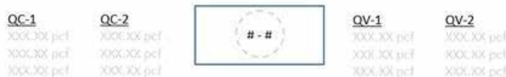
Figure 3: Layout of Raw Gauge Readings as Recorded on the Pavement

Take photos of each of the 10 core/gauge locations of the test strip. Include gauge readings (pcf) and a labelled core within the gauge footprint. If a third reading is needed, record and document all three readings. Only raw readings in pcf shall be written on the pavement during the test strip, with a corresponding gauge ID/SN (generalized as QC-1 through QV-2 in the following Figure) in the following format: