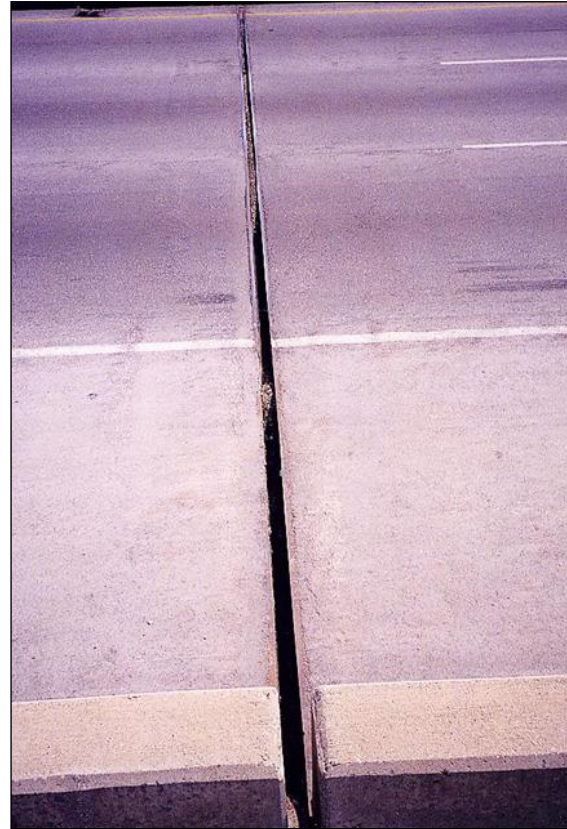
Figure 2.6.4.3-2: Compression Seal Pushed Down Into the Joint Opening - Condition State 3.