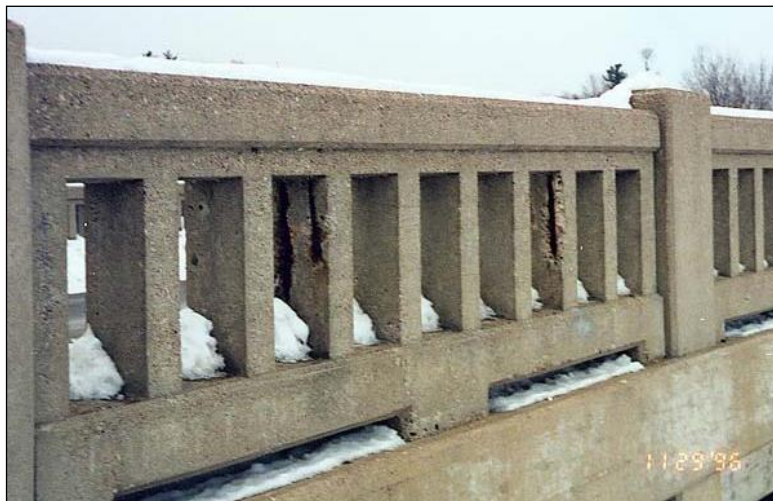
Figure 2.6.8.2-2 Concrete Bridge Rail – Most in Condition State 1 - Two Areas Condition State 3.