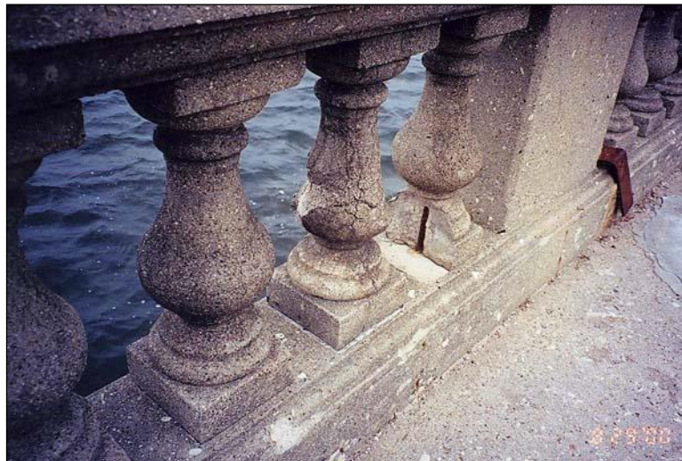
Figure 2.6.8.2-4 Ornamental Concrete Bridge Rail – Condition State 3