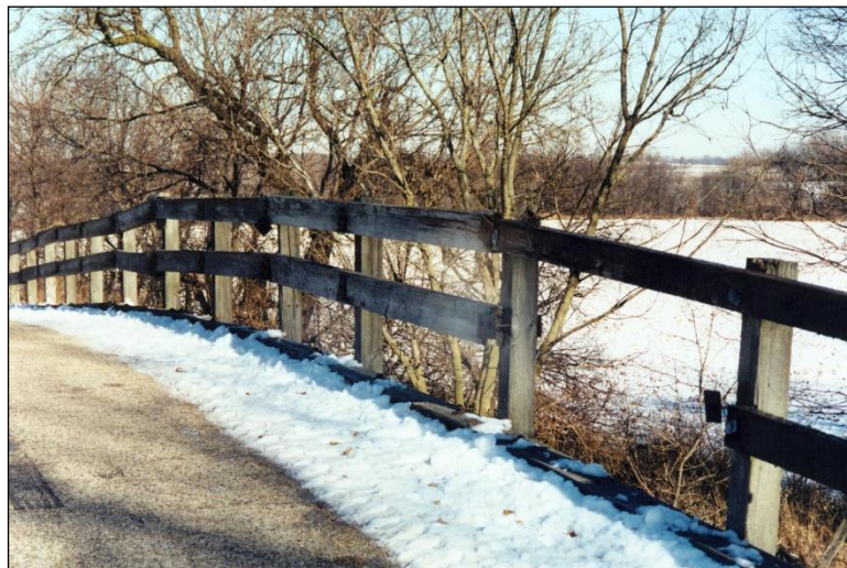
Figure 2.6.8.3-3 Missing Timber Bridge Rail Beam – Condition State 3