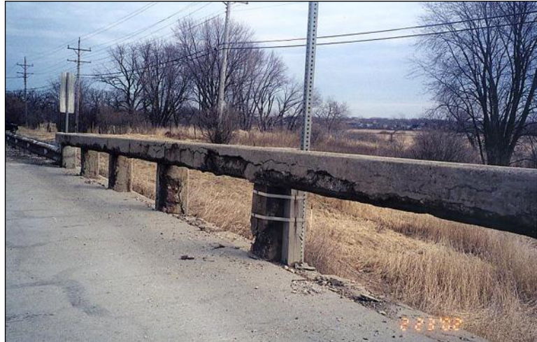
Figure 2.6.8.2-5 Concrete Bridge Railing - Condition State 4