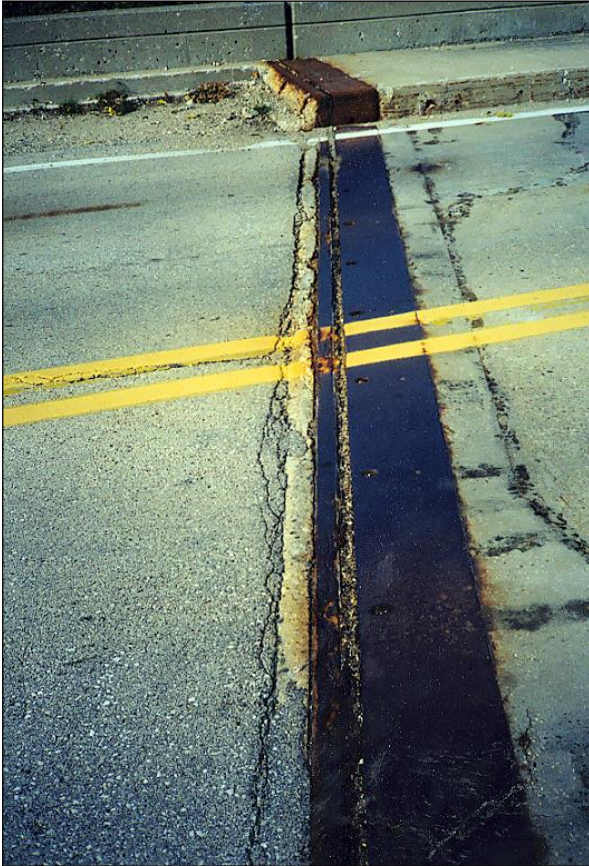
Figure 2.6.4.6-1: Sliding Plate Expansion Joint (Note Transverse Deck Crack on Left Side Suggesting a Failing Anchorage System) – Condition State 2.