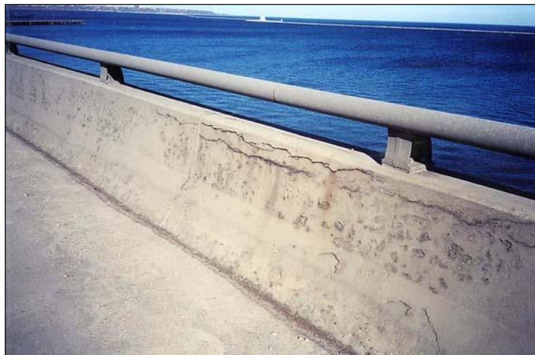
Figure 2.6.8.2-6 Concrete Railing with Decorative Rail Assessment – Condition State 3