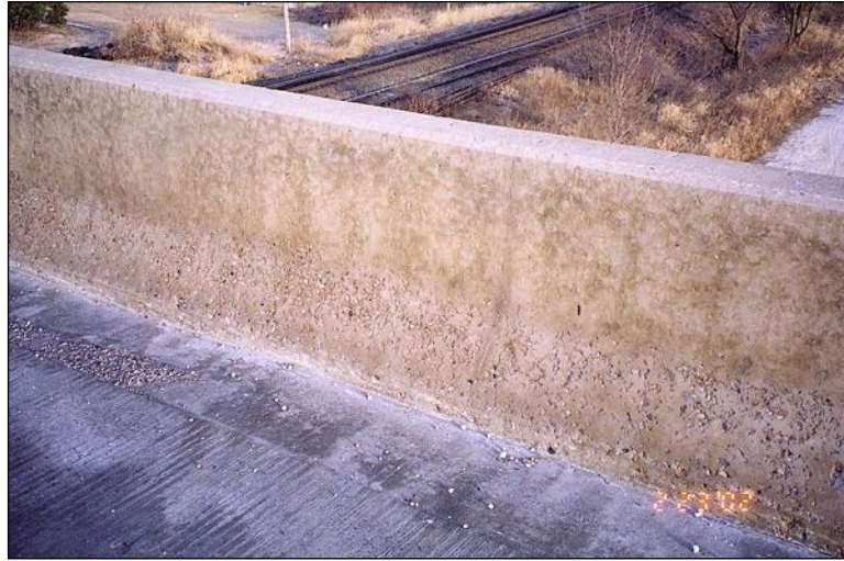
Figure 2.6.8.2-3 Scaling on the Lower Half of a Concrete Bridge Rail - Condition State 2