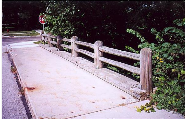
Figure 2.6.8.3-2 Timber Bridge Railing – Condition State 2