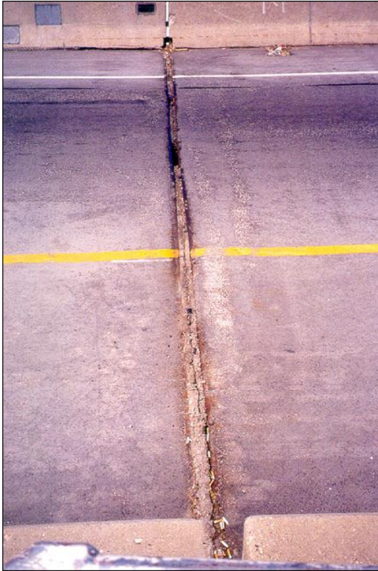
Figure 2.6.4.3-1: Compression Joint Seal Impacted with Debris and Pushed Down Into the Joint Opening (Far Lane)– Condition State 4.