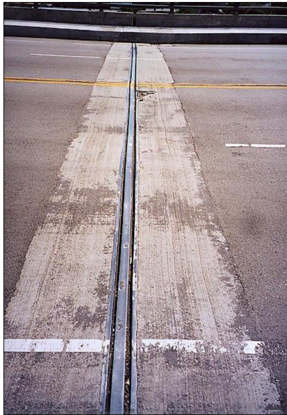
Figure 2.6.5.4-1 Modular Expansion Joint – Condition State 1

Open expansion joints, sometimes called formed joints, are little more than a gap between the bridge deck and the abutment backwall or between adjacent deck sections. Open joints allow water and debris to pass directly through the joint and directly onto the girders and