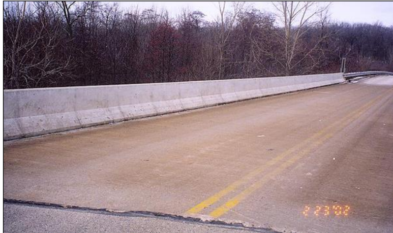
Figure 2.6.8.2-1 Concrete Bridge Railing - Condition State 1