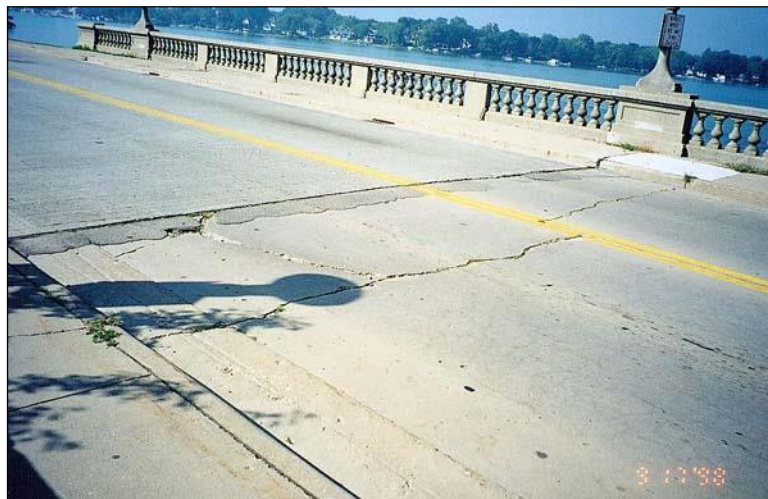
Figure 2.6.2.2-1 Concrete Approach with Wide Cracks – Condition State 3

Both Elements 320 and 321 are for structural approach slabs only. Non-structural approach slabs will be coded under the applicable Assessment. Structural approach slabs will have one end resting on the abutment paving notch, and the other end resting on a grade beam.