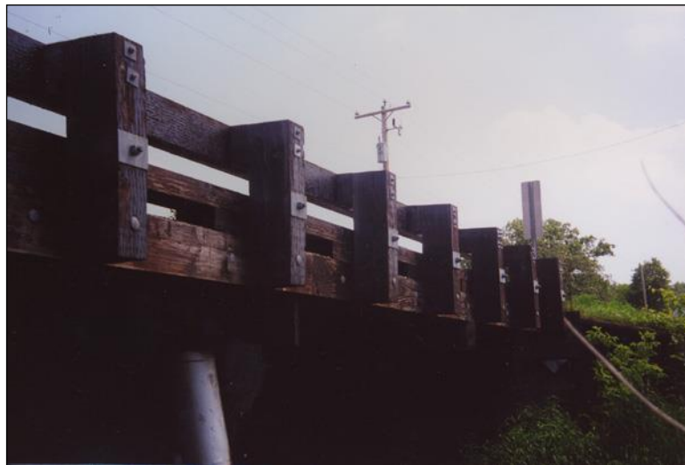
Figure 2.6.8.3-1 Timber Bridge Railing - Condition State 1