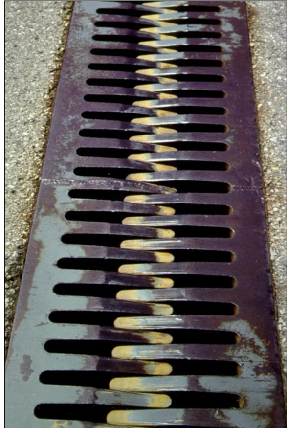
Figure 2.6.4.6-2: Finger Plate Expansion Joint – Condition State 1.