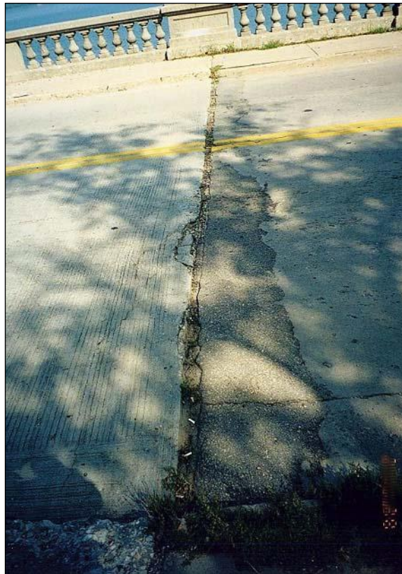
Figure 2.6.5.2-1 Poured Joint Seal – Condition State 3