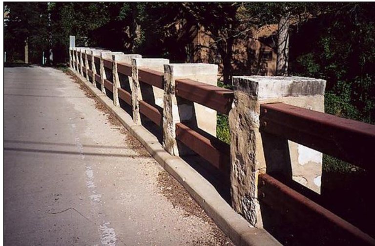
Figure 2.6.8.1-1 Metal Railing with Masonry Posts – Condition State 1

Metal rails may have multiple different materials associated with it. In other words, the metal rail would be the primary rail; however, it may have a concrete curb, steel posts, and timber blocking between the posts and railing associated with it. Due to this fact, it may be necessary to code defects of other material types under Metal Rail. The inspector shall report the material defects on the primary rail material when coding overlapping defects of similar conditions states.