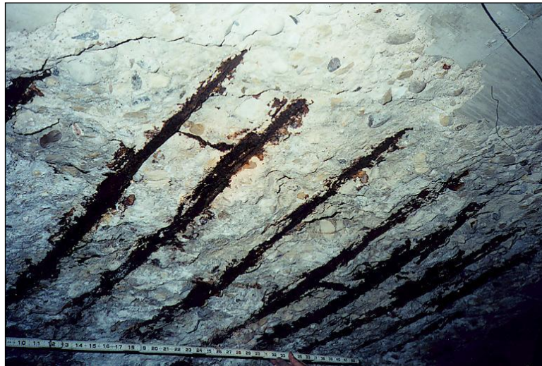
Figure 2.3.2.2-2: Reinforced Concrete Box Girder Top Flange/Deck Localized Rebar Corrosion and Bond Loss.

Temperature and shrinkage cracks are common and will be found on most every concrete surface. However, many types of cracks are more indicative of a structural issue. All types of cracking must be accounted for and a portion of the total quantity of the area must be assigned to a Condition State. Look on the top of the flange (deck side) for any cracking. Types of cracks commonly encountered include the following: