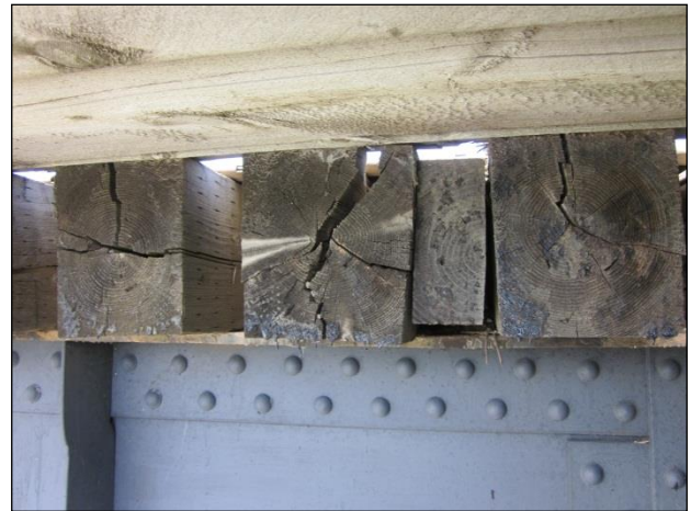
Figure 2.3.5.1-3: Timber Deck (Railroad Ties) – Condition State 3.