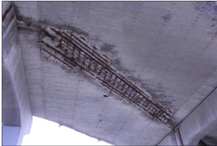
Figure 2.3.2.1-1: Reinforced Concrete Slab w/ Spalling and Exposed Corroded Reinforcing - Condition State 3.

When the inspector is evaluating the bottom of the deck, it is important to assess the amount of deterioration as it is a valuable window used to assess the structural condition of the interior and top of deck. The amount of deterioration on the underside is a good indication of how much moisture is passing through the element.