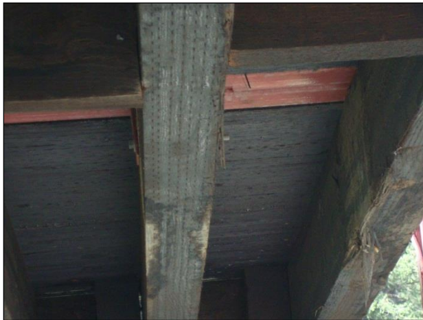
Figure 2.3.5.1-1: Timber Deck – Condition State 1.