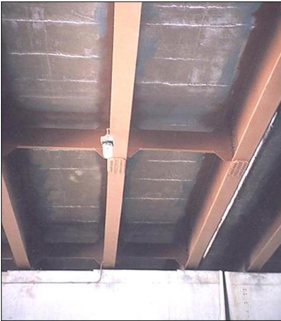
Figure 2.3.2.1-2: Cracking of Concrete Deck (Localized Area Over Pier) – Condition State 2.