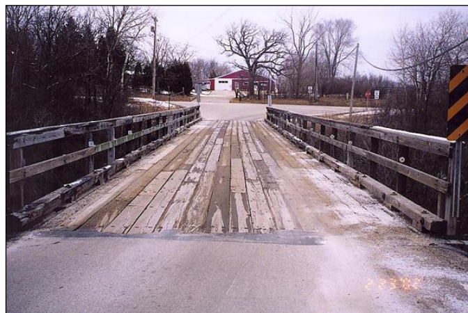
Figure 2.3.5-1: Timber Plank Deck (Top Surface Evaluated as Wearing Surface – Bare).