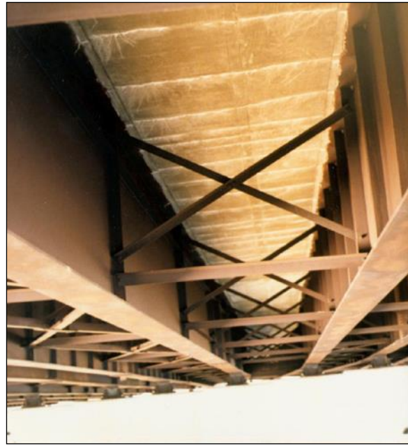
Figure 2.3.2.1-3: Heavy Density Cracking of Concrete Deck w/ Efflorescence – Condition State 3.