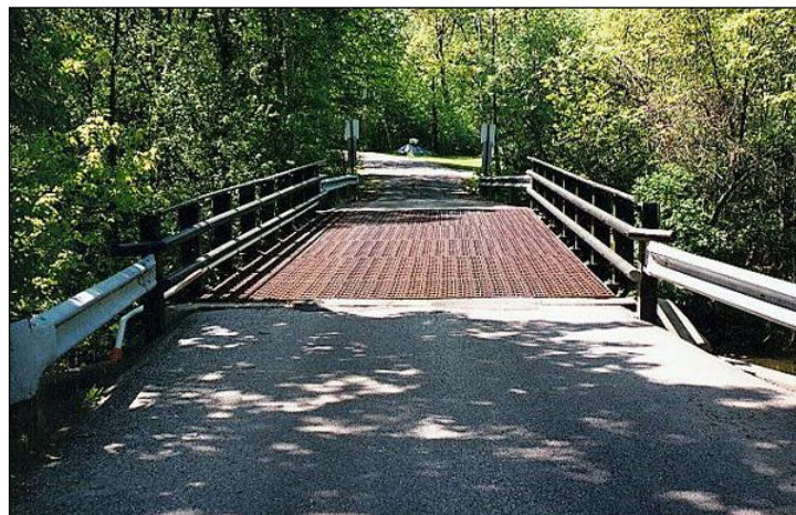
Figure 2.3.4.1-1: Open Grid Steel Deck.

Although they offer the advantage of a very light deck, open grid decks are constantly exposed to the elements. Even though they are often galvanized (and may even be painted), traffic wear quickly exposes the deck top surface. This leaves the deck vulnerable to corrosion. Open grids also leave the superstructure exposed to roadway debris, rain, and deicing chemicals. This can especially be a problem for movable bearings, which can lock up from pack rust and debris accumulation.