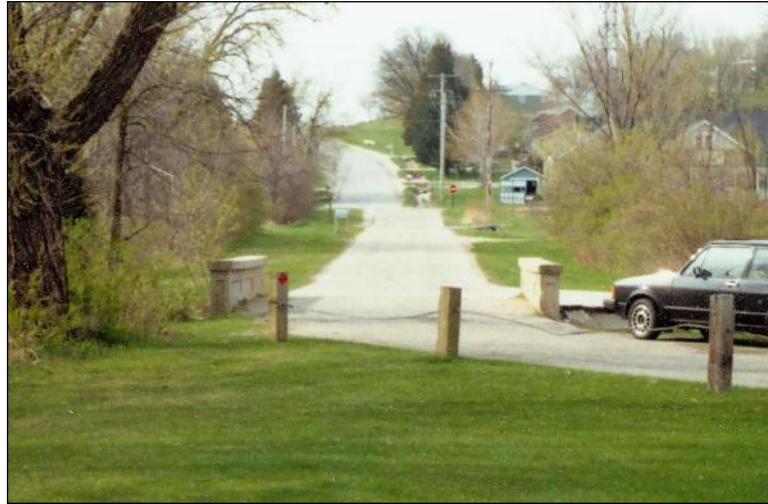
Figure 2.3.2.2-1: Reinforced Concrete through Girder Bridge.