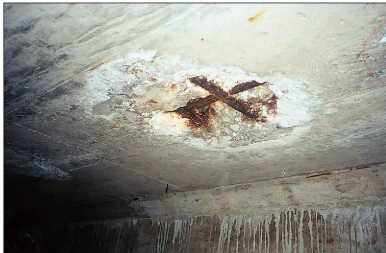
Figure 2.3.3.2-1: Localized Spall with Exposed/Corroding Rebar on the Deck Underside of a Post-Tensioned Box Girder.

Cracking not appearing to be temperature or shrinkage cracking is a significant cause of concern for any prestressed elements. Prestressing concrete is intended to keep the element in compression even under legal loading. A crack larger than hairline may be an indication of overloading. Inspectors should take care to detect and note any structural cracking in prestressed elements.