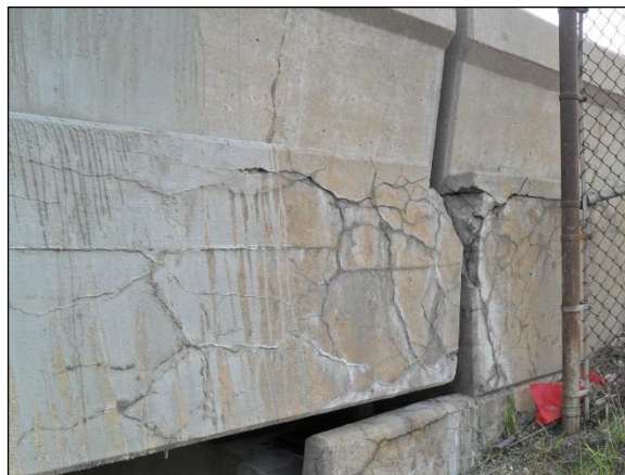
Figure 2.3.2.1-4: Typical Reinforced Concrete Slab Distress.

The Condition States for describe repaired areas. Repaired areas are considered “distressed” if the repair is a short-term maintenance action that does not restore the deck’s structural integrity (such as filling potholes with asphalt). Therefore these repairs do not improve the Condition State rating of an element. Repaired areas are considered “rehabilitations” if the repair (such as full or partial depth concrete patches) improves the deck’s structural integrity, thereby improving the rating after work has been completed.