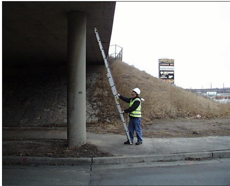
Figure 1.4.4.5-1: Access Equipment.

Access equipment, safety features, and procedures need to be evaluated prior to inspection. The safety sheet provided with the equipment, including emergency evacuation procedures, should be reviewed and understood.