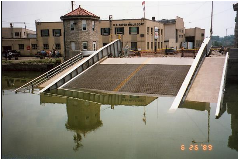
Figure 1.4.2.1-1: Failed Tayco Street Bascule Bridge, Menasha.

prevent any loss of property or life. It is also the responsibility of the inspector to detect minor problems in order to correct them early on and prevent more costly repairs in the future.