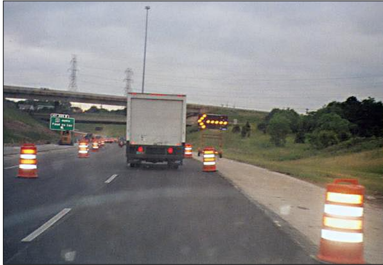
Figure 1.4.8.3-2: Directional Arrow Board and Channelizing Barrels.