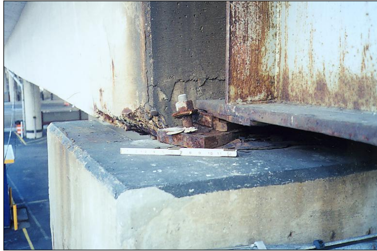
Figure 1.4.3.3-2: Failed Bearing at Pier.