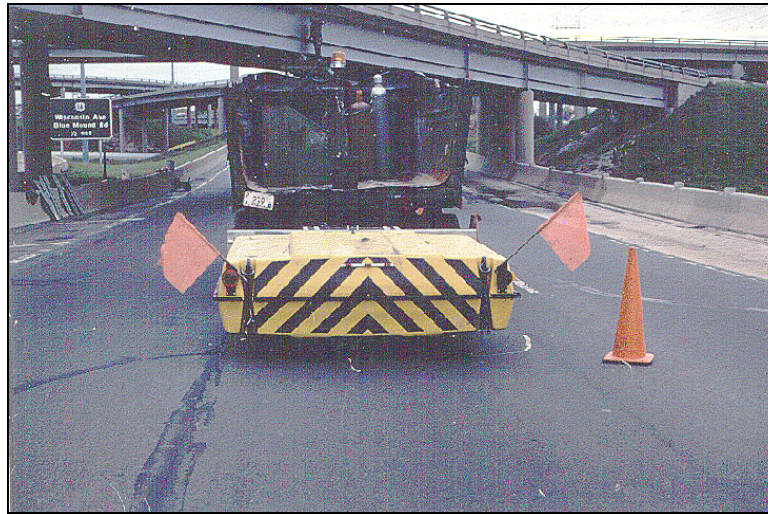
Figure 1.4.8.3-1: Truck Mounted Crash Attenuator.