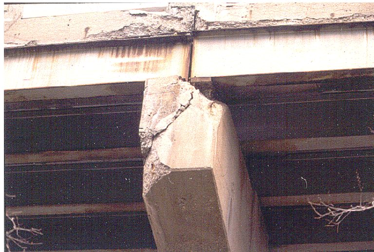
Figure 1.4.3.3-3: Damage Resulting From Failed Joint.