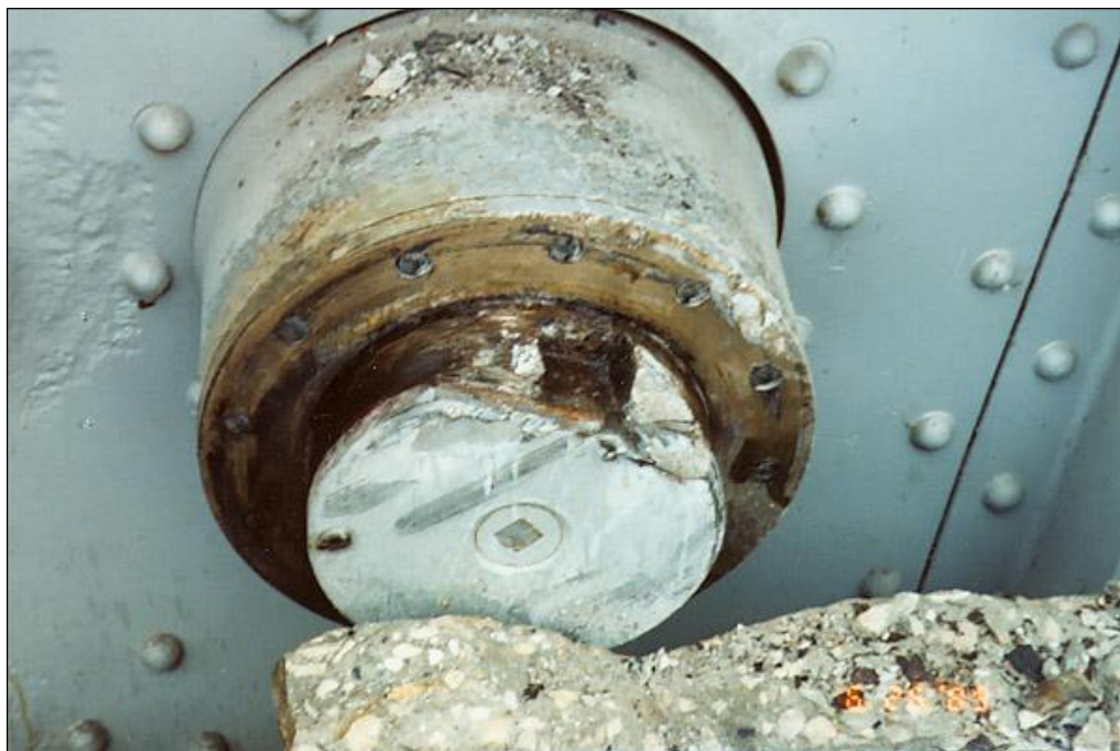
Figure 1.4.2.1-2: Failed Pin, South Bascule Span of Tayco Street Bridge.