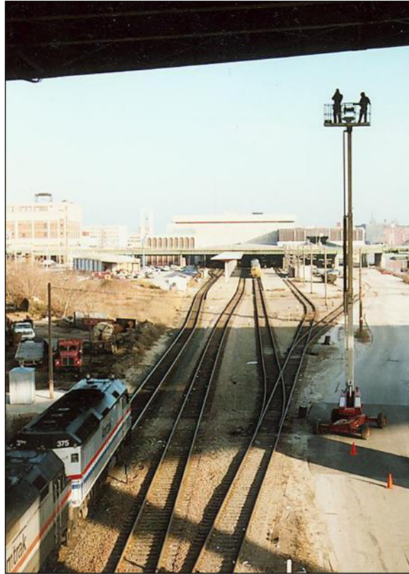
Figure 1.4.3.2-1: Inspectors Working Next to a Live Railway.

Inspectors should be aware of the rules and policies pertaining to confined space entry. The Occupational Safety and Health Administration (OSHA) definition of a confined space is as follows: