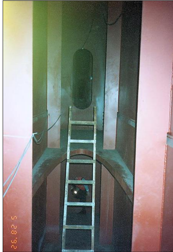
Figure 1.4.3.2-2: A View Inside of a Steel Box Girder.