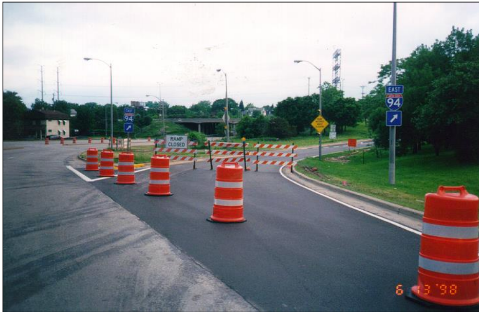
Figure 1.4.8.1-1: Barrels Channel Traffic Away From Work Zone.

The FDM is available from the WisDOT Bureau of Highway Operations and the federal MUTCD is available on the Internet at http://mutcd.fhwa.dot.gov/ . The FDM dictates the minimum traffic control requirements and the proper use of standard traffic control devices for various applications. The FDM also contains plan sheets with plan views of traffic control layouts for typical applications. These plan views detail the types of signs or message boards to use, the geometry of channelization devices, flagger requirements, etc.