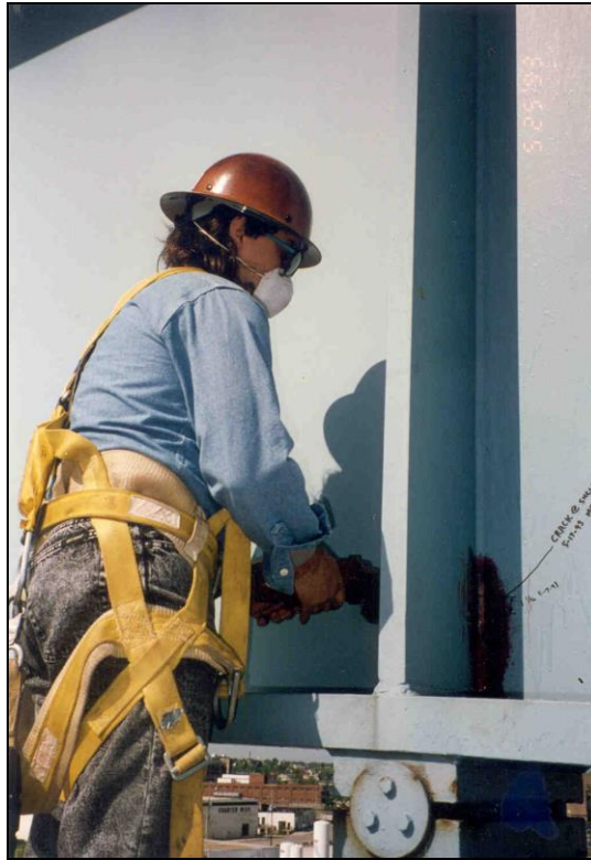
Figure 1.4.4.6-1: Body Harness/Tie-Off.