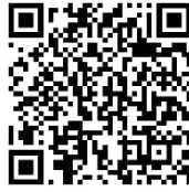
Figure 2: Project Website

You can also follow the Southwest Office of WisDOT on X (@WisDOTsouthwest) to be informed about information from around the region.