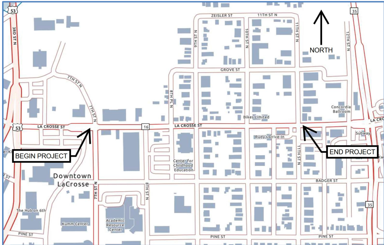
Figure 1: WIS 16 Location Map