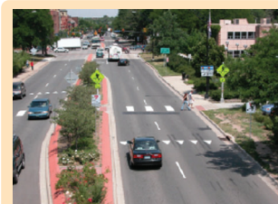
Enhanced Pedestrian Crossing