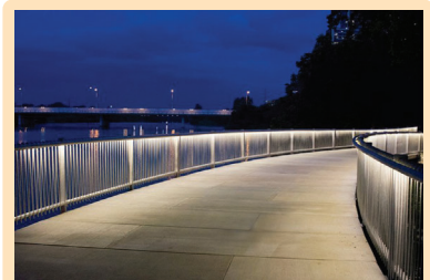
Pedestrian Scale Lighting