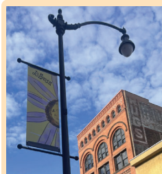
Decorative Light Poles