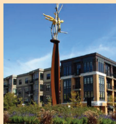
Public Art / Gateway Monuments