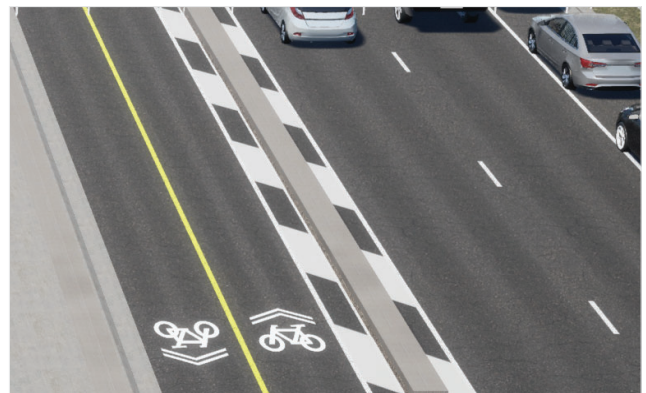
Separated Cycle Track