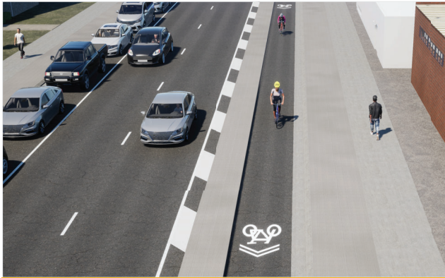
Separated Bike Lane