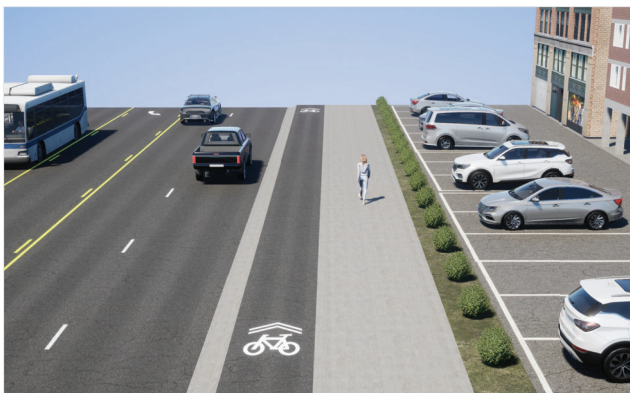
Sidewalk-Level Bike Lane