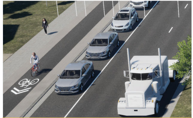
Parking-Separated Bike Lane