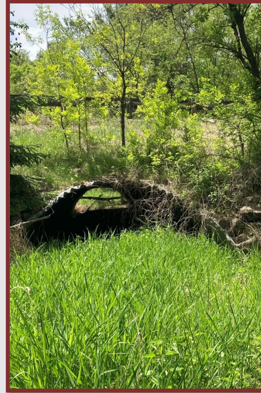
First Trestle Creek