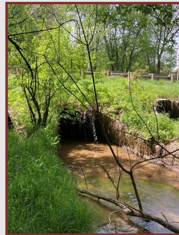
Diamond Valley Creek