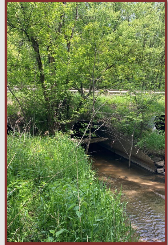
Diamond Valley Creek