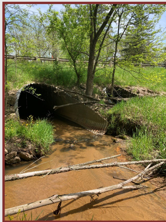
First Trestle Creek