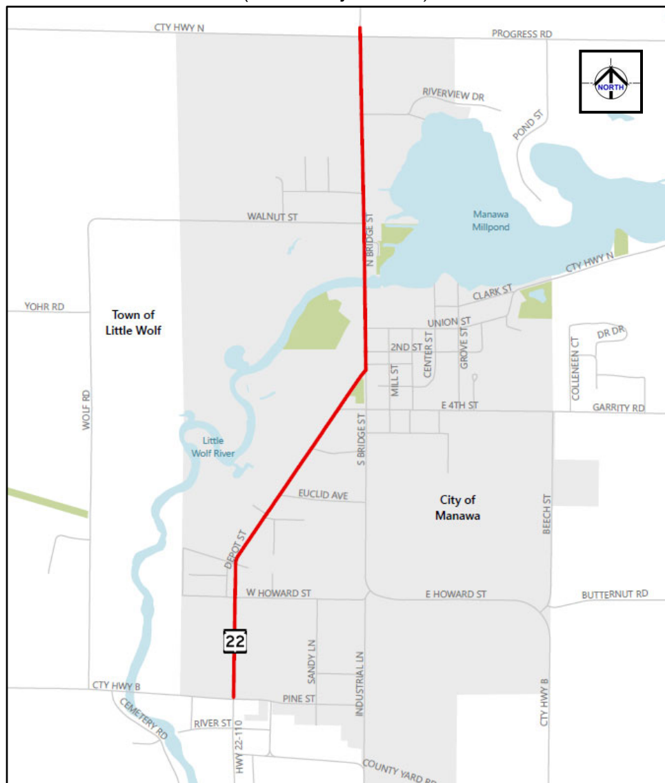
(WIS 22 Project Limits)

The project is located on WIS 22 in the city of Manawa and town of Little Wolf.