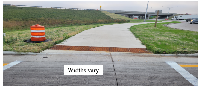
Example of compliant curb ramp