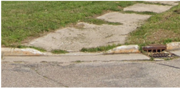
Example of non-compliant curb ramp

The Wisconsin Department of Transportation (WisDOT) is proposing to reconstruct curb ramps in spot locations along WIS 13, WIS 54 and WIS 73, throughout the city of Wisconsin Rapids to comply with the Americans with Disabilities Act (ADA). Construction is anticipated to start in 2029, could be as early as 2028 if an advanceable date is selected.