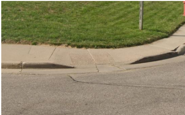
Non-compliant curb ramp