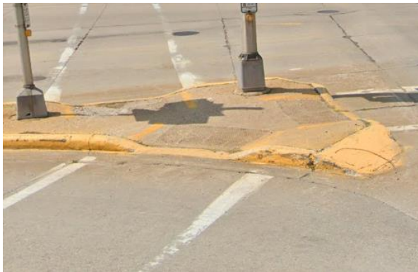
Non-compliant curb ramp