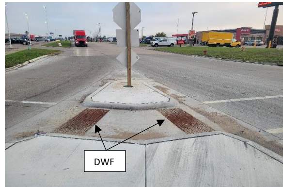
Compliant curb ramp