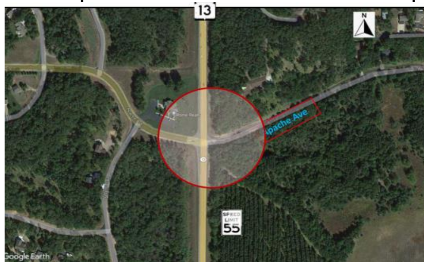
WIS 13/Apache Avenue Intersection location/detour map

Screening for impacts to archaeological and historic resources was completed. The proposed action met the requirements for the Section 106 screening list on Sept. 23, 2024.