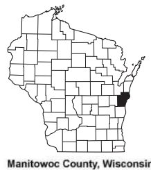
Manitowoc County, Wisconsin