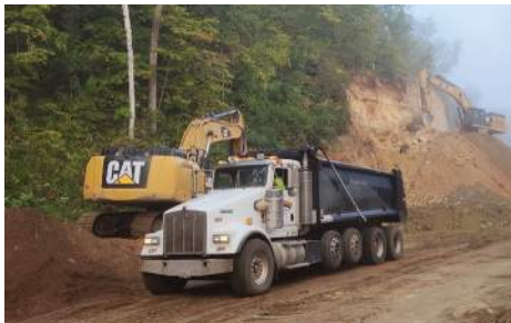
Fischbach, Inc.: on-site trucking