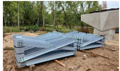
Aura Fabricators, Inc.: fabricated bridge diaphragms delivered to site and ready for installation