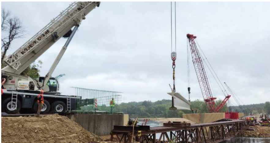
Modern Crane Service Inc.: girder erection