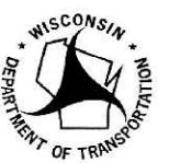
FIGURE NO. 1 JOB # 1089.184