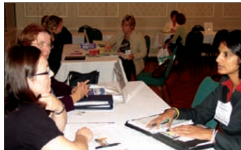
Marketplace Conference: One-on-one Sales Meeting