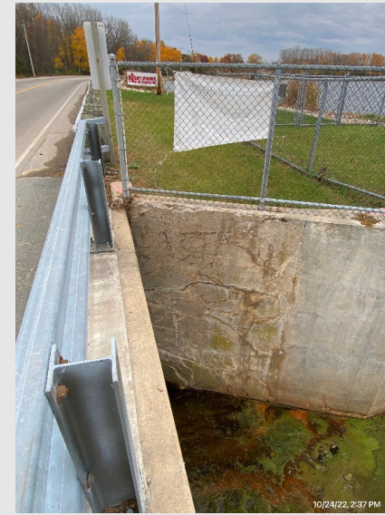
Deteriorated Dam Spillway Wall