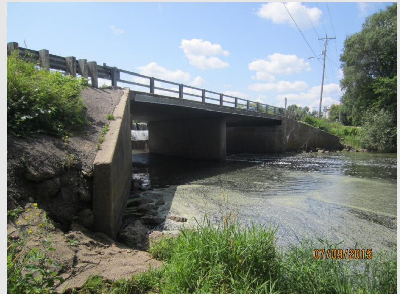
B-24-0019 (looking upstream)