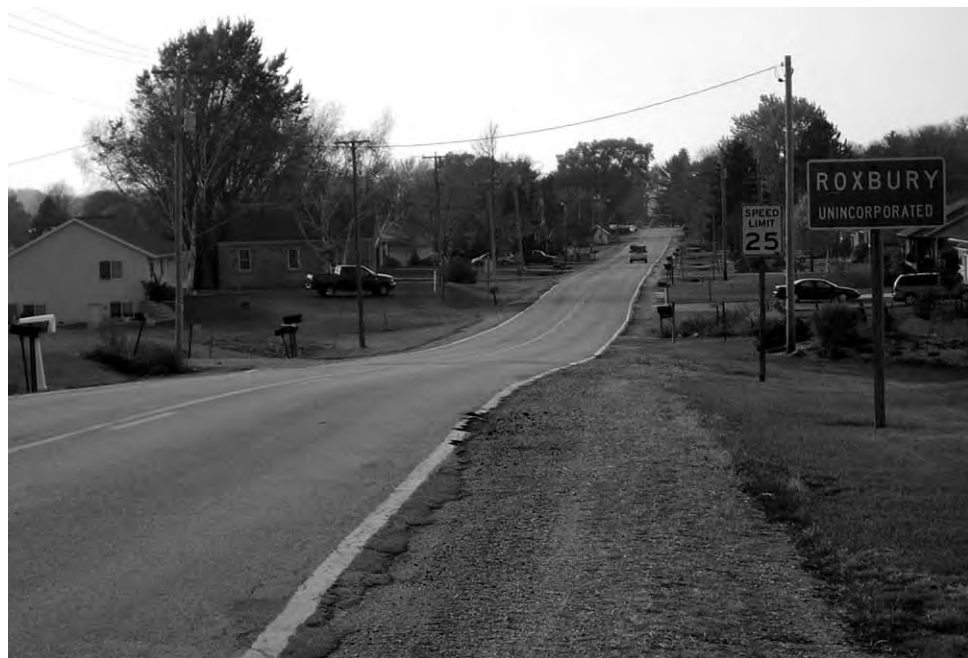
Figure 6: Farther from the center of town, homes may be isolated with few destinations within easy reach. In such areas (often called “semi-rural”), there may be only a rudimentary road network.

Typical trip purposes and common destinations: Studies like the National Household Travel Survey have shown that people use the bicycle most often for social and recreational trips, trips to school, and short “personal business” trips (e.g., trips to the store or to visit friends). They use a bicycle less often for work commute trips, partly because the commute trip tends to be longer than most other trip types and it is typically constrained to certain times of day and inflexible destinations. In small communities, the commute trip, however, may be quite short. In rural areas, it may range from a walk from the house to the barn to a long trip to a distant city.