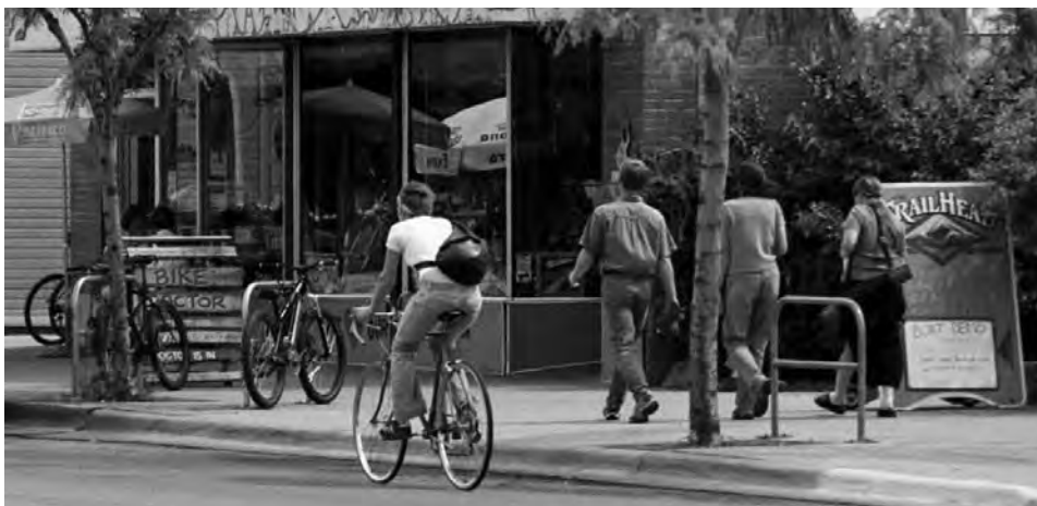
Figure 17: Since many motor vehicle work trips made within villages or small cities are less than five miles and a significant number are less than two miles, the potential for a shift to bicycling is considerable.

Another way to identify higher bicycle use corridors is to visually plot major trip generating centers such as schools, commercial areas, major parks, and large employers, and then connect these generators with anticipated high use residential areas. For slightly longer distance bicycle travel considered in county-level plans, desire lines can be plotted between all of the villages and cities in a county.