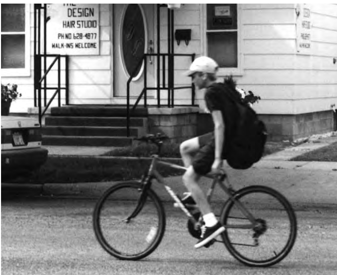
Figure 18: Elementary and middle schools generate child bicycle trips that may need special planning attention as a foundation for a "Safe Routes to School" program.

Elementary and middle schools generate child bicycle trips that may need special planning attention as a foundation for a "Safe Routes to School" program. Simple travel surveys conducted in cooperation with the schools may show bicycling to account for as much as 15 percent to 30 percent percent of trips, depending on trip lengths and street characteristics. University campuses typically generate bicycle trips in excess of 10 percent of all trips and often remain high through the winter months. In addition, many university students use a bicycle as their primary means of transportation. Second, parks, beaches, trails, parkways, scenic roads and other recreational areas attract a higher percentage of bike trips than the community average. Parks with long trails typically attract many users who drive to the trailhead with their bikes on their cars.