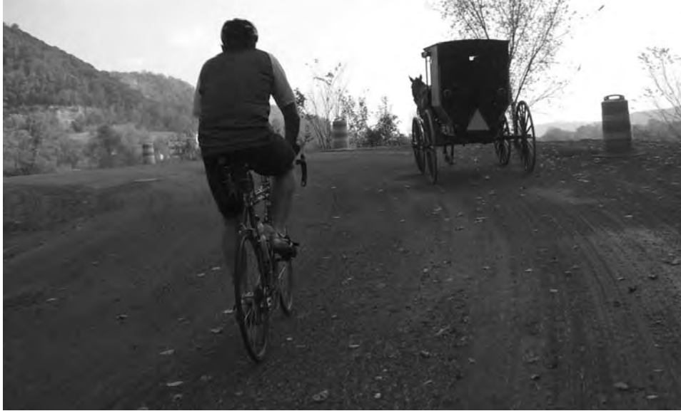
Figure 16: Many cyclists consider Wisconsin's rural roadway system ideal for cycling.

cyclists' subjective impression that there is "no traffic on low volume roads," or that riding on a certain rural roadway is like "riding on a bicycle path interrupted by an occasional motor vehicle."