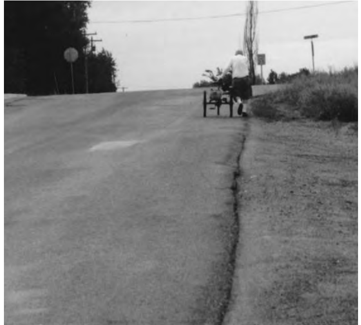
Figure 5: For seniors, bicycling is an excellent low-impact form of exercise and far less expensive than driving. For some, bicycling and walking may be their only means of independent travel.

Where they live and what's nearby: In villages and small towns, bicyclists often live near at least a few important services and destinations. They might be just down the road from a school, grocery store, drug store, park, or library. In towns and villages with well connected streets, they may have several choices of how to get from point A to point B. In such areas, residents may use bicycles for a variety of trips but may be discouraged by high levels of traffic on main streets or highways that pass through.