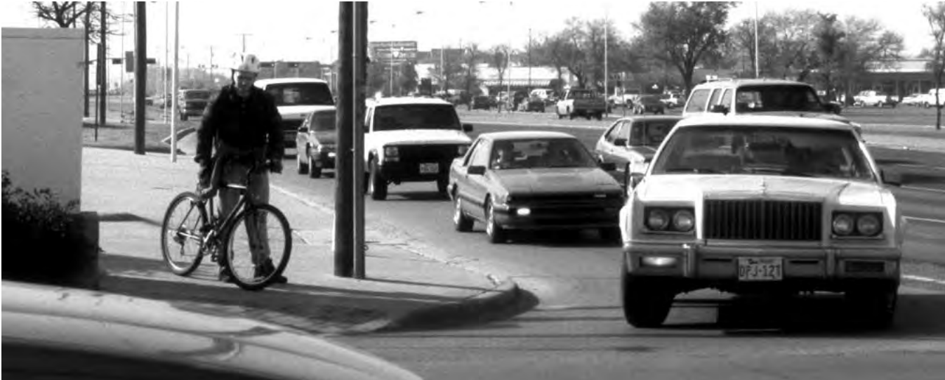
Figure 11: For years, bicyclists were largely left out of the transportation planning process. However, starting with the 1991 federal transportation bill (ISTEA), planning for bicyclists has become a legitimate element in that process.