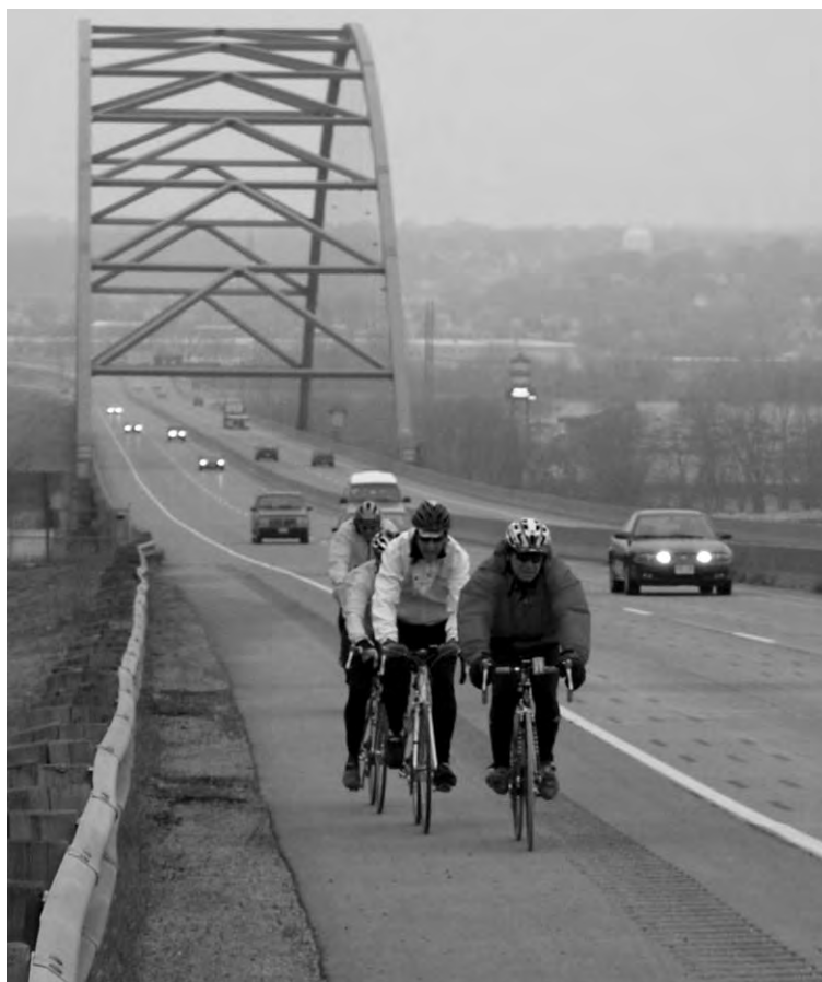
Figure 1: Striped shoulders on higher-volume rural roadways and bridges can serve bicyclists well — and provide a breakdown lane for motorists.

Bicycling is an important mode of transportation, whether used separately or with other modes. Since 1991, the federal government has recognized this role and its importance as part of a balanced transportation system. The Intermodal Surface Transportation Efficiency Act of 1991 (ISTEA) placed increased importance on the use of the bicycle from a transportation standpoint and called on each state Department of Transportation to encourage its use. With the passage of the Transportation Equity Act for the 21st Century (TEA-21), the federal government reaffirmed its commitment to bicycling, and SAFETEA-LU.