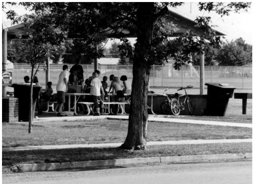
Figure 14: On a warm summer day, the whole family might bicycle to the park for a picnic.