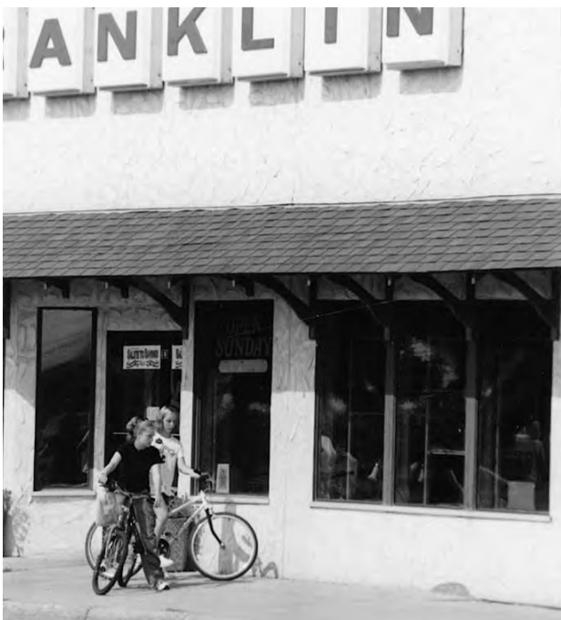
Figure 4: A bicycle may be many kids' primary means of independent mobility.