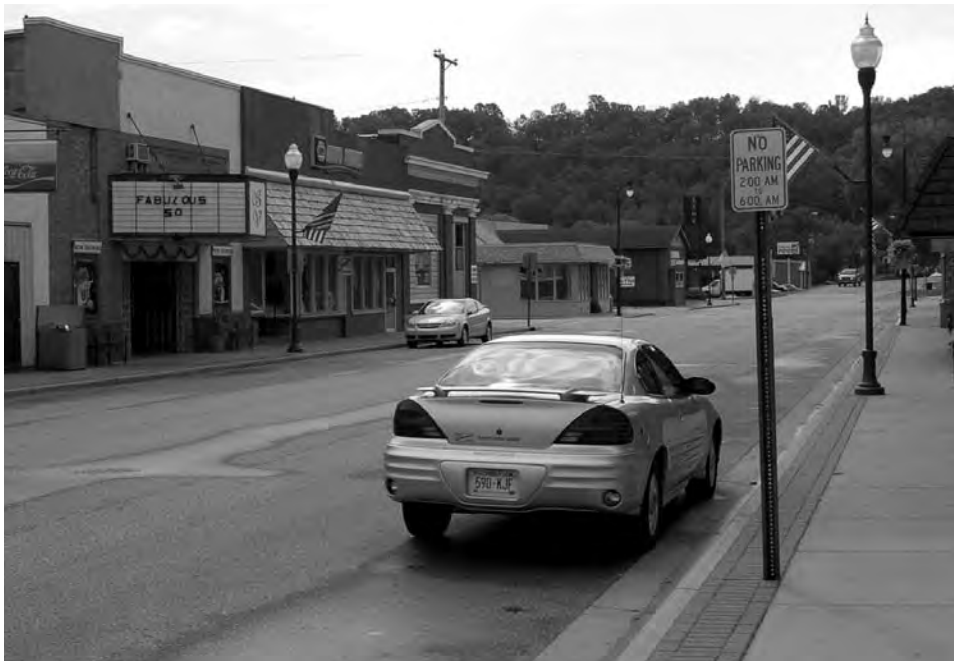
Figure 19: In many small communities, the main roads are the two state highways or a state highway and a county trunk highway that intersect in downtown. Most streets and highways can be improved at the time of street reconstruction.

For county level bike plans, the suitability analysis should be very helpful at this point. By drawing the simple desire lines between communities and overlaying those on the suitability maps, some unacceptable and some desirable means of connecting between communities will naturally surface. If the immediate goal is to produce a bicycle map, routing cyclists an indirect way may be necessary to make suitable connections. However, for the long-term plans, the more direct ways should be identified for improvements.