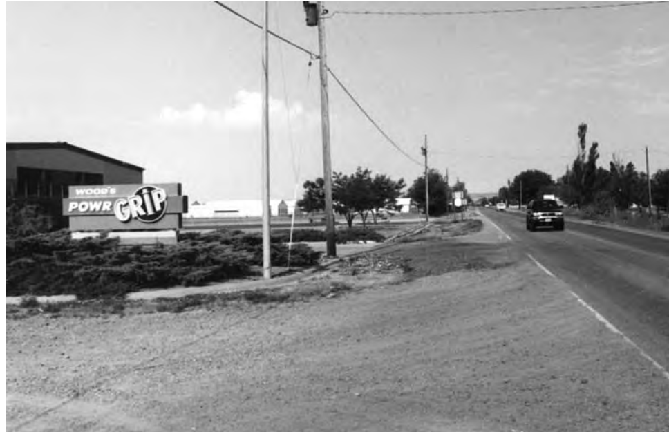
Figure 8: The primary emphasis of these guidelines is on developing a more “bicycle-friendly” transportation system. Providing basic elements like paved shoulders and low-maintenance intersection and driveway designs can eliminate hazards like those shown.

A planning and design approach will encourage bicycling among occasional riders through a system of bicycle facilities while basic design considerations, like safe drainage grates and paved shoulders for rural roadways or bike lanes on arterial streets, will improve accessibility for all bicyclists.