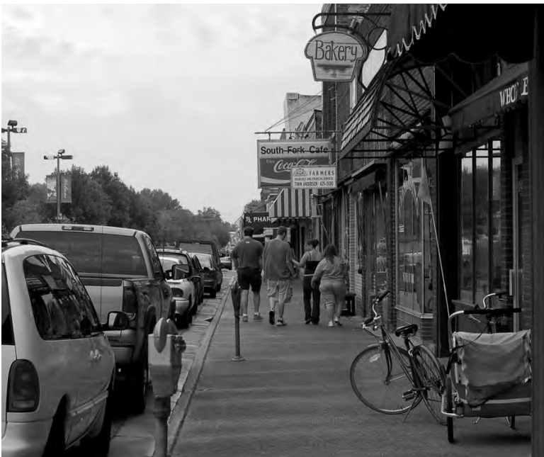
Figure 3: In small towns, many destinations are conveniently reached by bicycle.