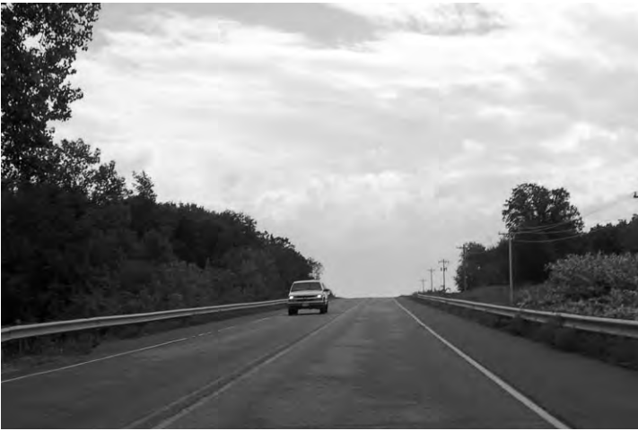
Figure 15: This rural highway bridge has a generous shoulder with a good surface, making it quite suitable for use by experienced adult cyclists.

Roadway Conditions for Bicycling: A major component of these planning guidelines is the identification of bicycling conditions on rural roadways. Wisconsin has an excellent tertiary roadway system (town roads) connected by an excellent secondary system (county trunk highways). Many of these roads have low or very low volumes of traffic making them suitable, if not desirable, for cycling without any roadway changes. Wisconsin is unique, in that most of the tertiary road system in the state is paved. This is not the case in other states.