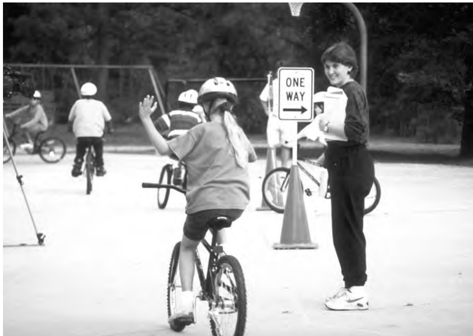
Figure 21: Elementary school students learn some of the basic elements of safe bicycling.

In some cases, for instance, a two-way-left-turn-lane may be removed and replaced with turn bays only at specific locations where turning volumes warrant. In other cases, extra space may be shifted from interior through-lanes to outside lanes. It is important to keep in mind that this is a long-range plan. As such, bringing existing arterials and bridges up to a basic level of accommodation may only be accomplished over a 20-30 year period.