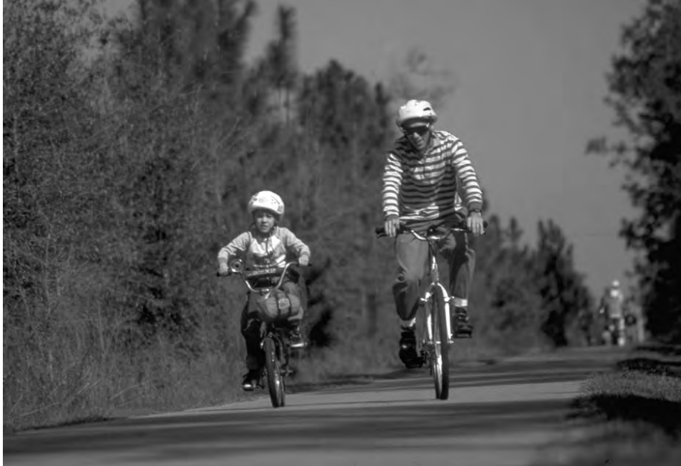
Figure 2: Shared-use trails in rural areas attract bicyclists of all ages. They can provide a peaceful and worry-free recreational experience.

There are several bicycle planning models currently in use in the United States. The process described here was developed by WisDOT. A number of reference materials and guides were consulted in developing these guidelines. They were prepared by the American Association of State Highway and Transportation Officials (AASHTO), the National Center for Bicycling & Walking, and the Florida DOT, as well as Wisconsin's Planning Guide for Development of Pedestrian and Bicycle Facilities (Governor's Office of Highway Safety, 1977) and the 2003 edition of the Wisconsin Bicycle Planning Guidelines for MPO's . Any organization preparing a bicycle plan or designing bicycle facilities should consult the Wisconsin Bicycle Facility Design Handbook.