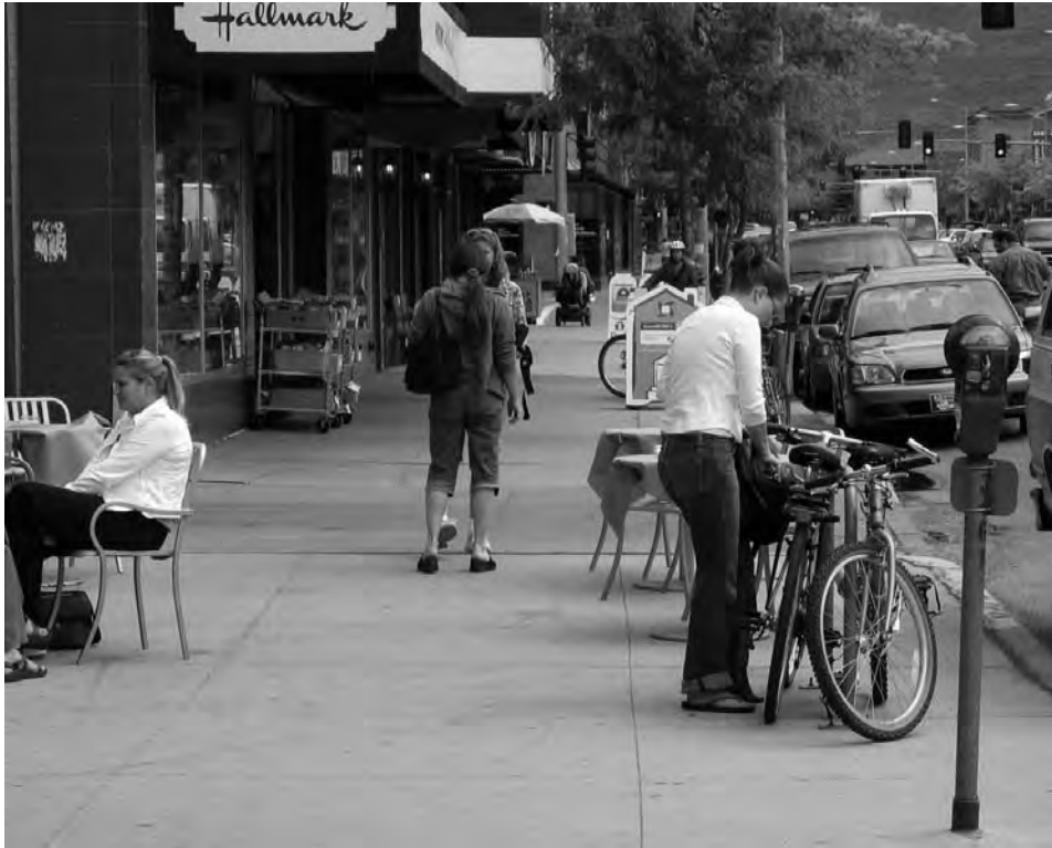
Figure 7: In smaller towns, bicycling to downtown may be easy and convenient. Providing improvements like bike racks, bike lanes, and the like can help bring new business to the town's center.