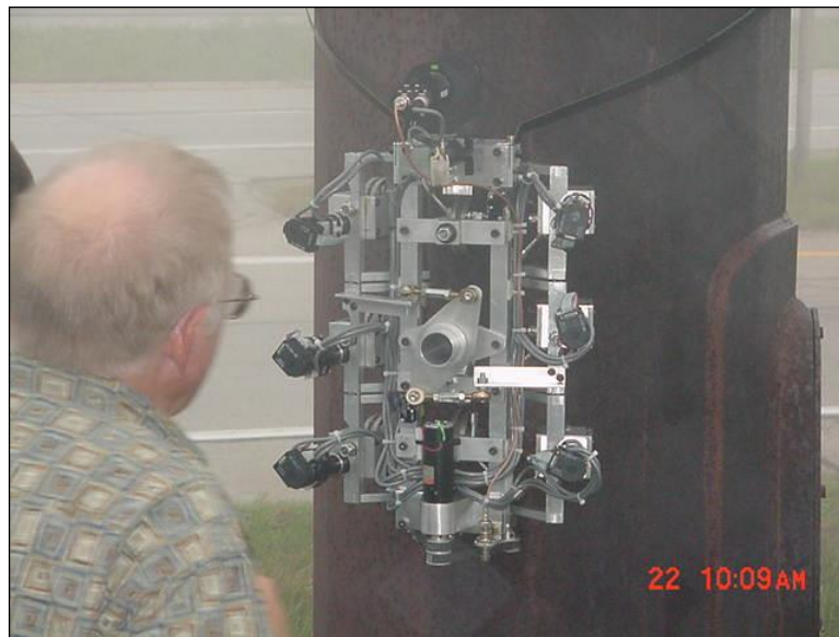
Figure 4.3.5-1: View of a Magnetic Climbing Camera Unit Used During Close Visual Inspection.

If severe deterioration is noted or suspected during the maintenance related or routine inspections, a need for an in-depth inspection may be warranted. A detailed inspection will be scheduled on an as-needed basis.