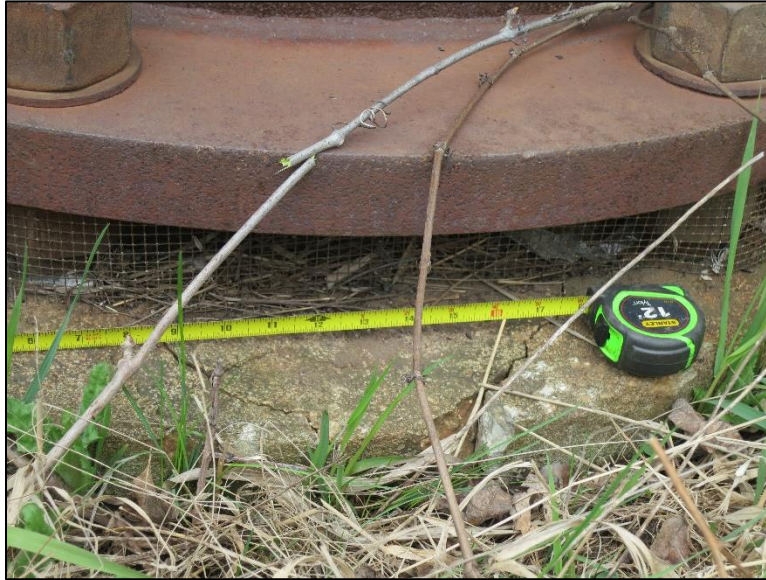
Figure 4.3.4-1: View of Rodent Screen between Base Plate and Foundation.

Refer to the following assessment states: