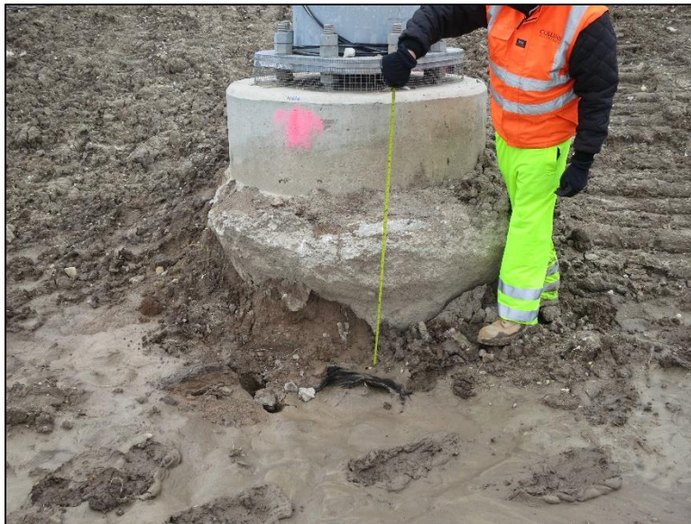
Figure 4.3.3-4: Exposed Foundation Due to Adjacent Construction Work. Condition State 3.