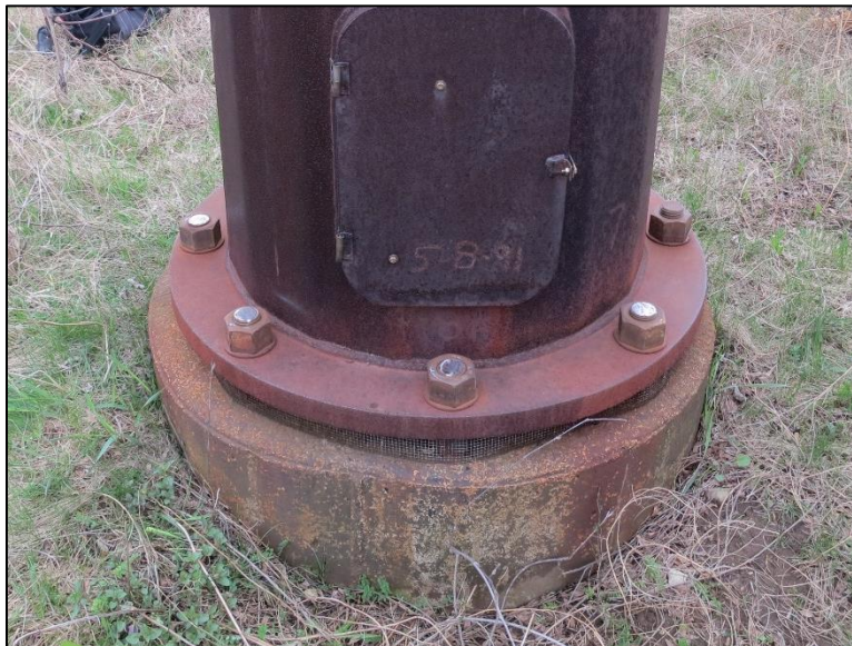
Figure 4.3.3-6: View of Weathering Steel Base Plate.

This assessment element defines the base plates, flanges, gusset plates, seam welds, and welds at the connection of the column support to the foundation. Base plates are typically welded to the pole, and secured to the anchor rods using high strength nuts and washers. Leveling nuts are used below the base plate to align the structure, and the anchor nuts are utilized to secure the plate to the leveling nuts. The base plate transfers loads from the pole to the anchor rods.