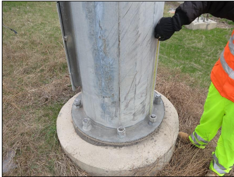
Figure 4.3.3-7: View of Minor Scraping Exhibited at the Bottom of the Vertical Pole. (Condition State 2).