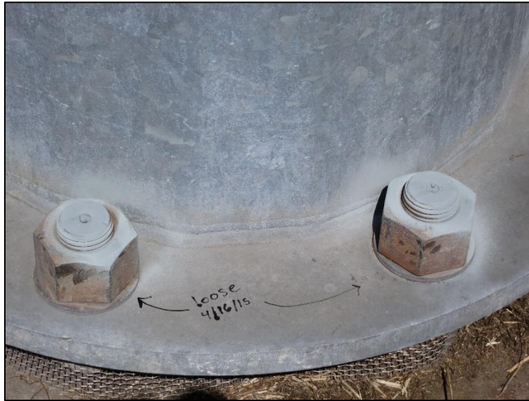
Figure 4.3.3-5: View of Loosened Anchor Rods. Note No Jam Nuts Over Anchor Nuts. Condition State 4 (2 Each).