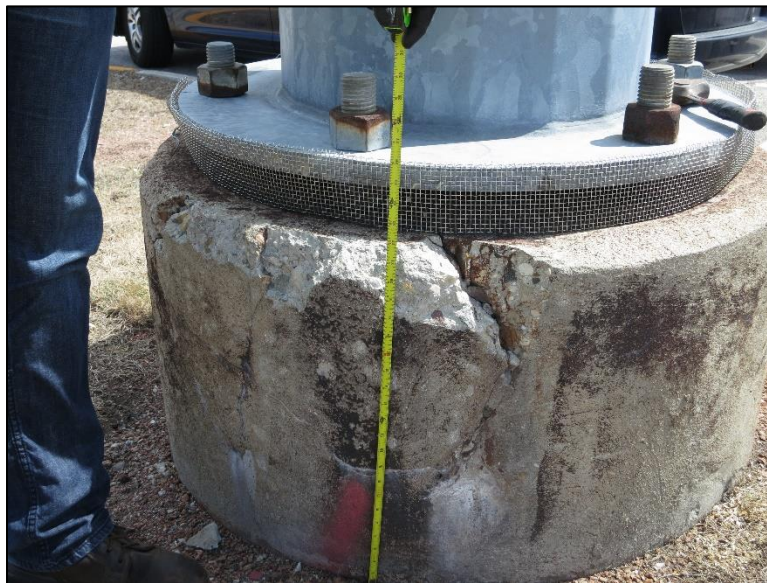
Figure 4.3.3-3: View of a Delaminated/Spalled Concrete Foundation – Condition State 3.

Reinforced concrete bases and foundations are made by placing ready-mix concrete into slip forms steel reinforcing throughout the foundation. The soil adhesion, skin friction, and bearing pressure resist loading from the structure.