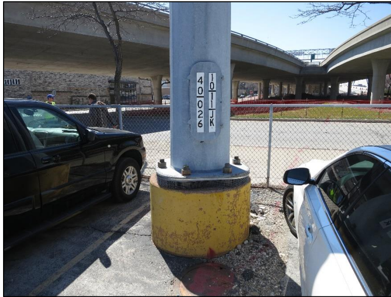
Figure 4.3.4-6: View of a Structure ID Plaque.

Refer to the following assessment states: