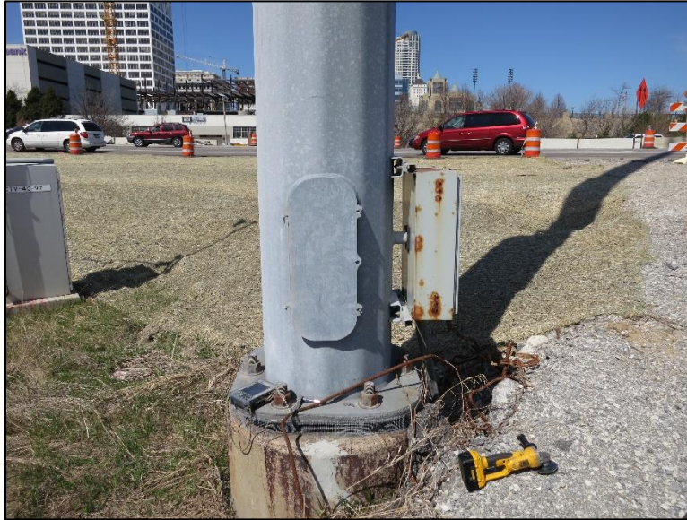
Figure 4.3.4-4: View of a Handhole Cover.

Refer to the following assessment states: