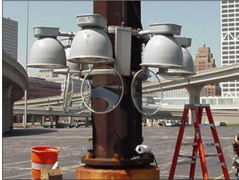
Figure 4.3.5-2: View of a Typical Luminaire Ring, Lowered for Maintenance.