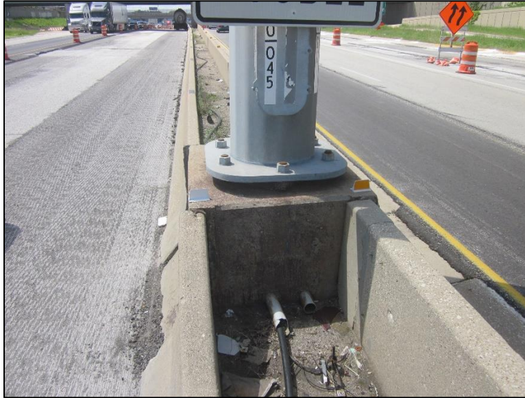
Figure 4.3.4-5: View of Barrier Wall Acting as Crash Protection System for Structure.

Refer to the following assessment states: