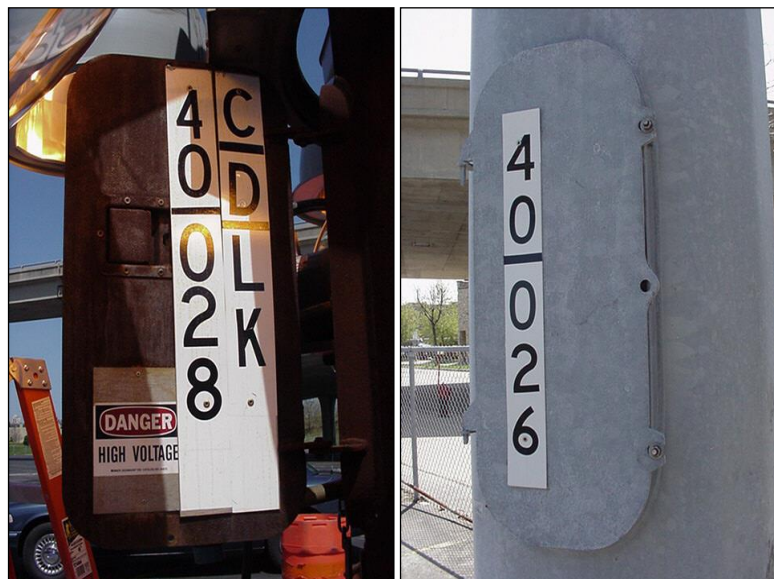
Figure 4.3.5-5: View of the Hatch Doors for Old and New High Mast Light Towers.

Refer to Figure 4.3.5-5 for a close-up view of the hatch doors on an old and a new high mast light tower. There are differences in the door design on the older structures as shown on the left compared to the new structures as shown on the right. The new door is secured with bolts, a lock in easily accessible areas such as Park and Rides, and no longer has a latch. Note that the electrical circuit plaque has not yet been installed on the new structure.