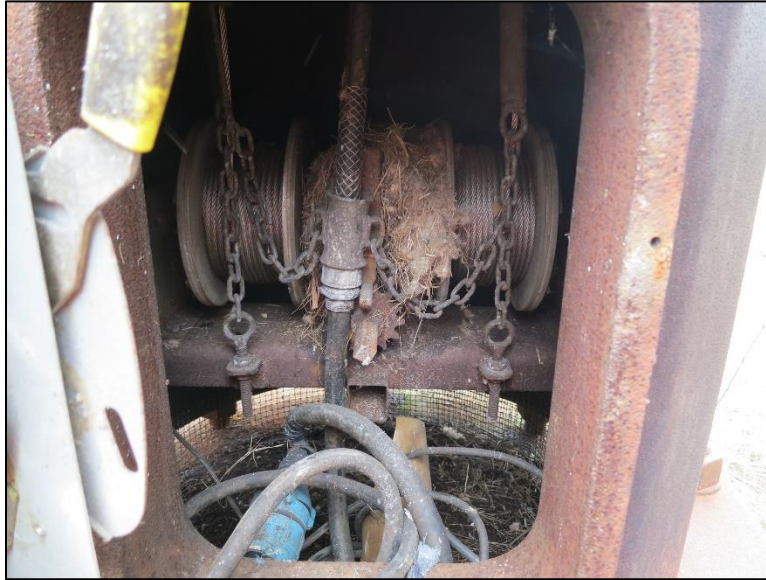
Figure 4.3.4-3: View of an Internal Winch System. Note Nesting Material Located Between Spools.

Refer to the following assessment states: