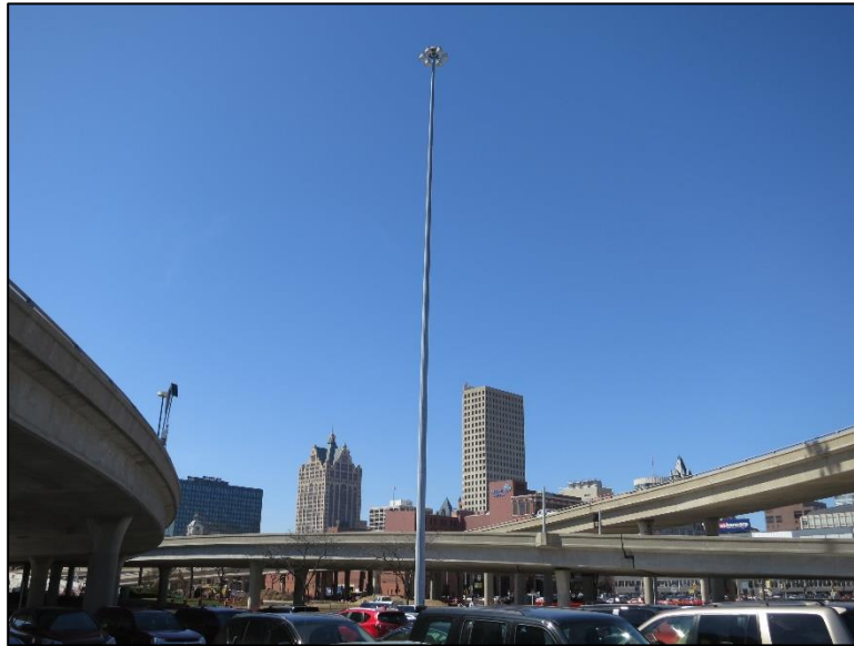
Figure 4.3.3-1: Overall View of a Typical High Mast Light Tower.