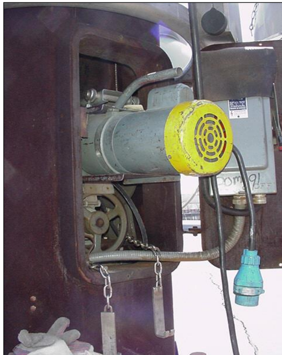
Figure 4.3.5-3: View of the Hatch Opening and Internal Winch System with a Portable Motor.