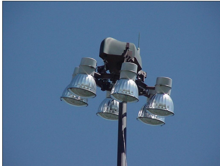
Figure 4.3.5-4: View of a Misaligned Luminaire Ring.

Refer to Figure 4.3.5-5 for a close-up view of the hatch doors on an old and a new high mast light tower. There are differences in the door design on the older structures as shown on the left compared to the new structures as shown on the right. The new door is secured with bolts, a lock in easily accessible areas such as Park and Rides, and no longer has a latch. Note that the electrical circuit plaque has not yet been installed on the new structure.