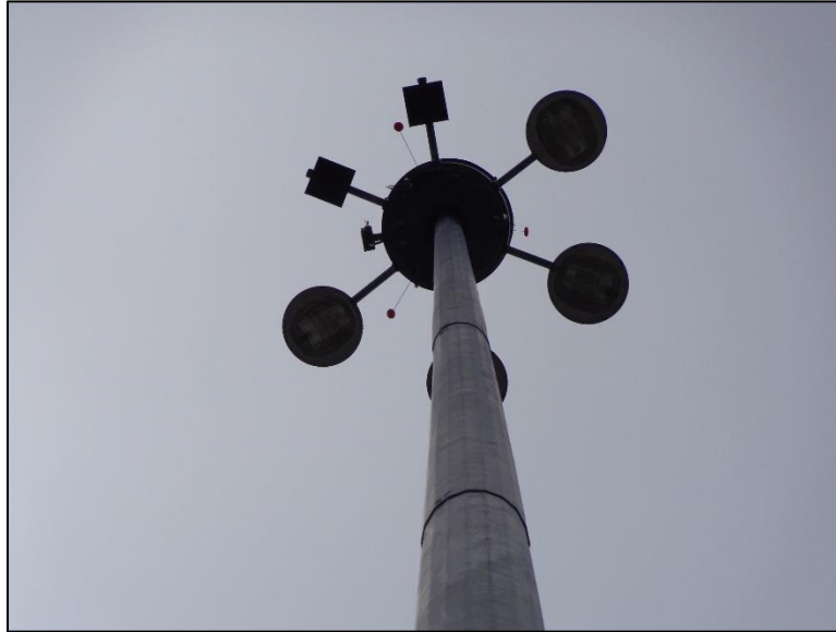
Figure 4.3.4-2: View of Luminaire Ring.

Refer to the following assessment states: