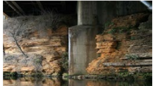
Bridge abutment on sandstone on WIS 13 in Wisconsin Dells.

Sandstone samples subjected to the modified slake test exhibited significant mass loss. Sandstone's GSN and \beta were higher than those of limestone/dolostone, gneiss and granite, indicating that, under high stream powers, sandstone is more susceptible to higher scour rates than the other rock types investigated.