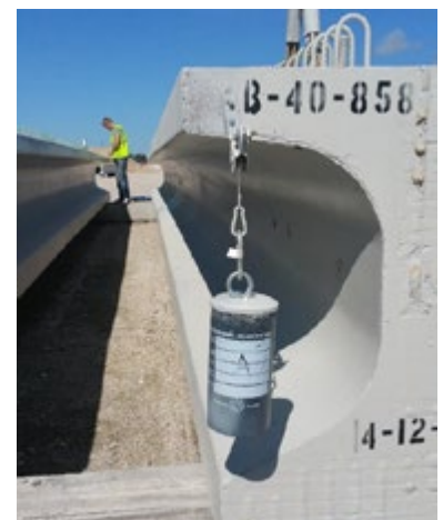
Camber was measured early in the morning to mitigate thermal effects.

Five mixtures were selected for further testing under the mixing, curing and quality control procedures of the three precastors, and the specimens' creep and shrinkage were examined for 280 days. One mixture was selected for casting a full-scale prestressed SCC girder to monitor structural performance, and a conventional concrete (CC) girder with similar target compressive strength was fabricated as a control specimen. Prestress losses and camber for both the SCC and CC girders were then monitored in the precast yard for 161 days, and their transfer lengths were measured for 28 days.