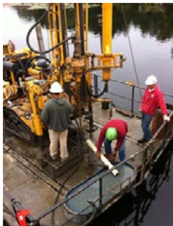
Drilling in granite on the Eau Claire River.

The project oversight committee and the research team selected 10 bridges, the majority of which rest on spread footings or shallow foundations. The bridge sites were chosen for their higher rate of water flow and representation of bedrock types common to Wisconsin, such as sandstone, limestone/dolostone, gneiss and granite.