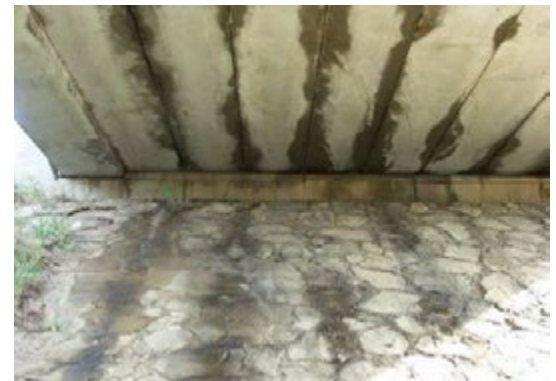
Moisture ingress through cracks and shear keys.

Deck cracking over the shear keys was documented shortly after construction and after five months. Refined finite element analysis was conducted by incorporating user subroutines to simulate concrete strength and shrinkage development with time. The temperature gradient effect was also investigated.