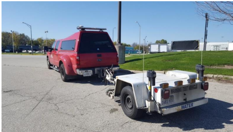
Figure 1: Typical Test Equipment for Skid Testing

Research funding was used to take friction readings following AASHTO T242 Standard Method of Test for Frictional Properties of Paved Surfaces Using a Full-Scale Tire . Friction readings continue to be collected over time on HFST as well as other candidate treatments of the roadway. Performance models will be developed based on the readings.