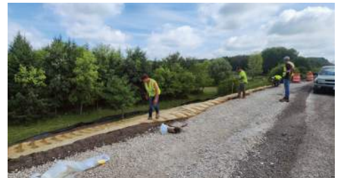
VanZile Contractors place and stake an erosion mat for restoration.

One of the keys to success was the strategic inclusion of Hofacker Construction Services, Inc. and Vanzile Contractors, LLC for pipe supplies and landscaping, respectively. Change orders that added pipe and grading areas increased quantities for both subcontractors. NEA utilized a portable plant location and outsourced hauling, primarily to DBE firms, to surpass the original goal. Involving second and third-tier DBE subcontractors further contributed to the project's success. Northeast Asphalt and subcontractors further utilized DBE trucking firms during operations that were not part of the original commitment, which further increased the achieved DBE amount. ANASA Traffic Control Services, LLC. was also utilized as needed on the project.