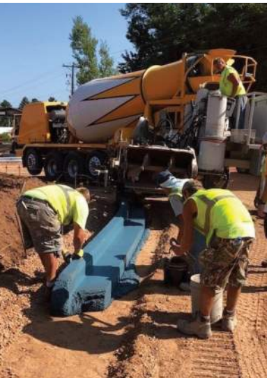
Project in Menominee utilizing the Native American Hiring Provision.